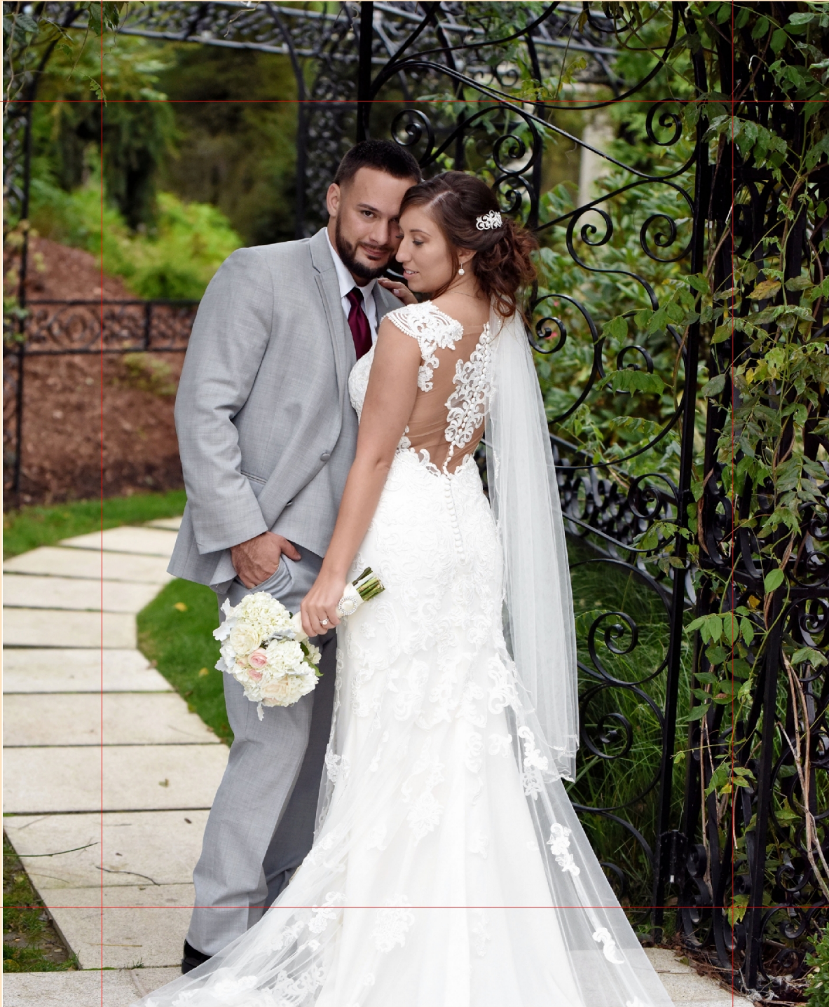
Family Flex 8x8

It is necessary that the area outside the red lines, that is the abundance of the picture for the preparation of the cover, does not remain white. Must be covered entirely by the image selected, avoiding that it contains important details, because they will not appear on the front cover.