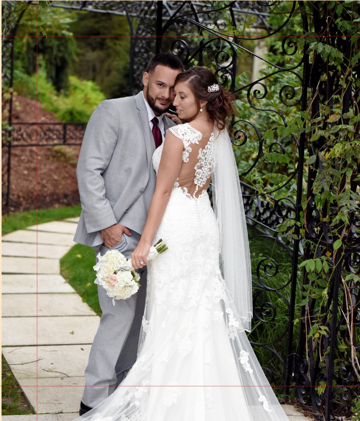
Wedding Album 10x10 (COMO-1-CONT)

It is necessary that the area outside the red lines, that is the abundance of the picture for the preparation of the cover, does not remain white. Must be covered entirely by the image selected, avoiding that it contains important details, because they will not appear on the front cover.