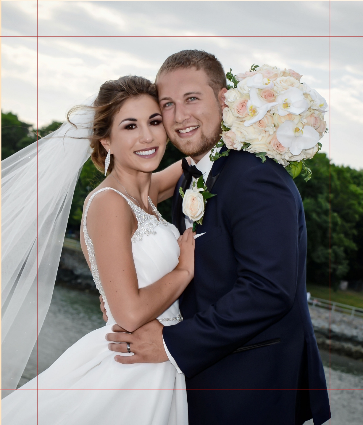
Wedding Album 10x10 (COMO-1-CONT)

It is necessary that the area outside the red lines, that is the abundance of the picture for the preparation of the cover, does not remain white. Must be covered entirely by the image selected, avoiding that it contains important details, because they will not appear on the front cover.