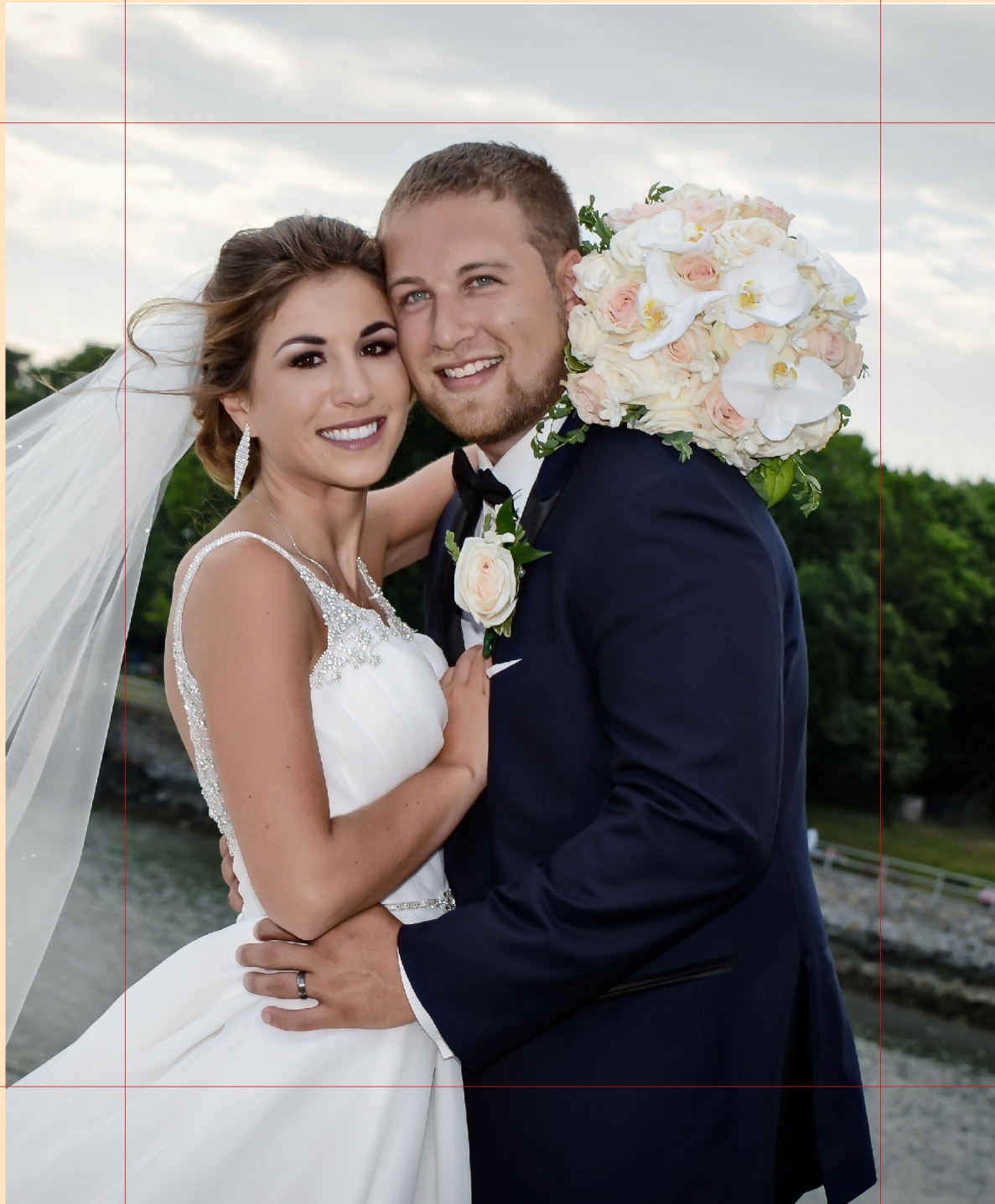
Family Flex 8x8

It is necessary that the area outside the red lines, that is the abundance of the picture for the preparation of the cover, does not remain white. Must be covered entirely by the image selected, avoiding that it contains important details, because they will not appear on the front cover.