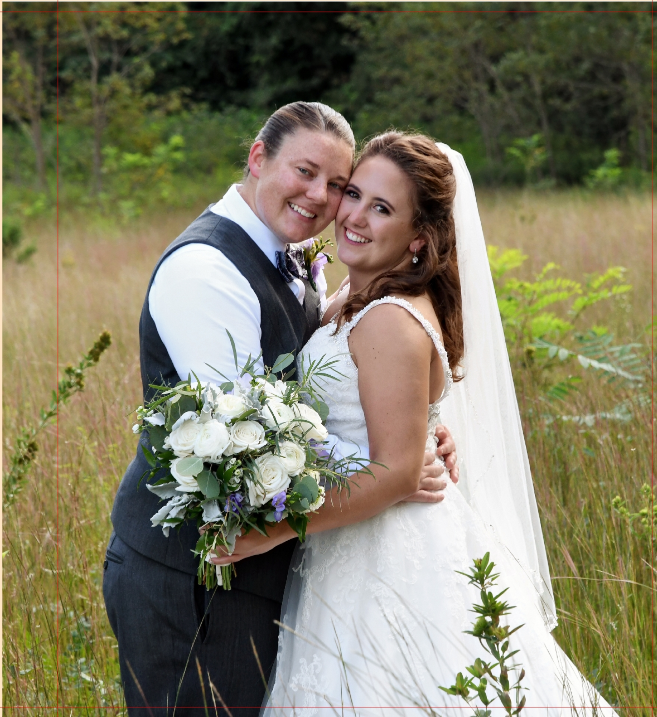
Wedding Album 12x12 (ATLANTICCITY-4-CONT)

It is necessary that the area outside the red lines, that is the abundance of the picture for the preparation of the cover, does not remain white. Must be covered entirely by the image selected, avoiding that it contains important details, because they will not appear on the front cover.