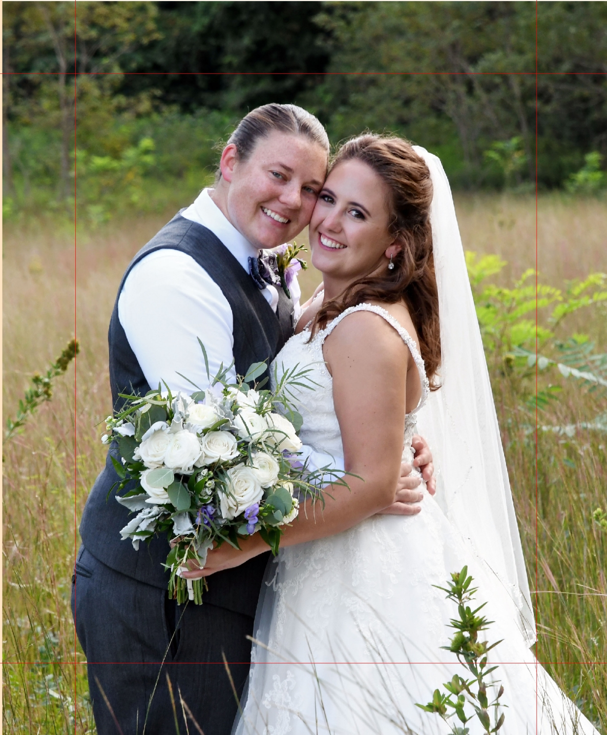
Family Flex 8x8

It is necessary that the area outside the red lines, that is the abundance of the picture for the preparation of the cover, does not remain white. Must be covered entirely by the image selected, avoiding that it contains important details, because they will not appear on the front cover.